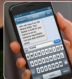
TEXT TO WIN